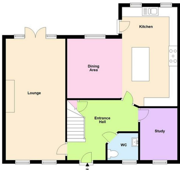
Ground Floor Approx. 74.4 sq. metres (800.8 sq. feet)